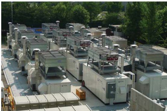
Samsung - GS Power in Anyang, South Korea