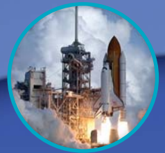
SPACE & DEFENSE