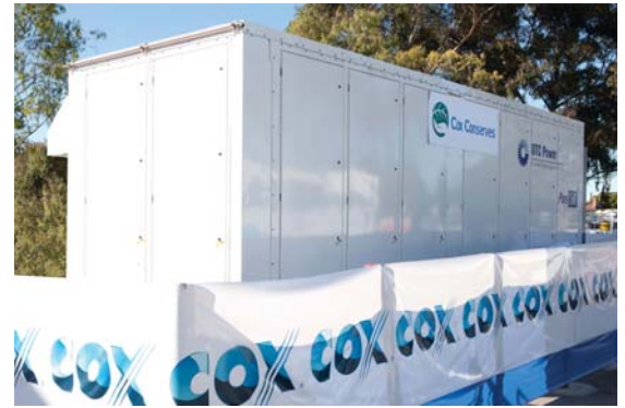
Cox Communications in San Diego, CA

The PureCell Model 400 solution provides up to 400kW of assured electric power plus up to 1.7 million btu/hour of thermal energy to supermarkets, hospitals, hotels, food/bottling, manufacturing, mixed-use office/residential, schools and other energy-intensive buildings. Fuel cells also contribute points towards LEED™ (Leadership in Environmental and Engineering Design) certification.