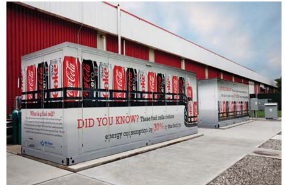
Coca-Cola Refreshments in Elmsford, NY